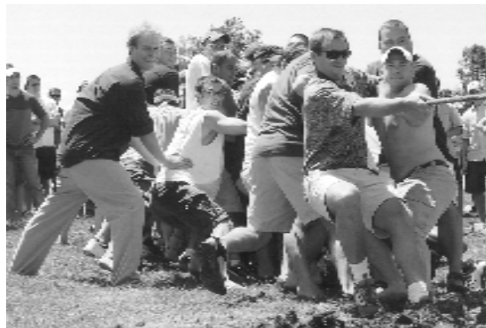
NYCC's third-trimester class won first place in the tug-of-war contest.